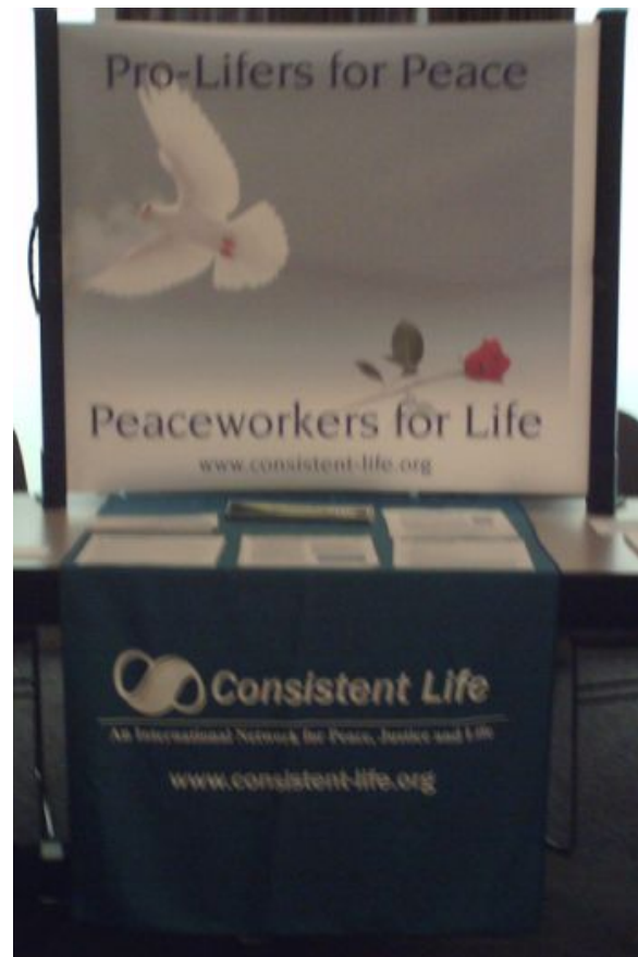
CL table-top display and table runner

Board members and supporters of Consistent Life took part in many events during the year. Our message has great visibility now with the striking table display and table runner, new in 2008, promoting our vision. The table displays, distribution of printed materials and our ads in programs and packets have presented the consistent life ethic to many thousands of people.